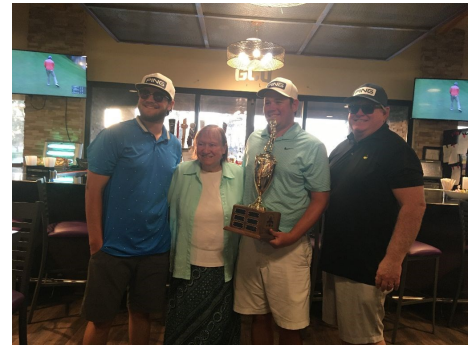
The winners! All SSSJ graduates!

Grand Canyon University Golf Course in Phoenix was the site of the annual Saint Simon and Jude Golf Tournament. The 7200 yard course challenged golfers on every hole! The extended fairways and deep bunkers were as difficult as playing in 95 degree heat!