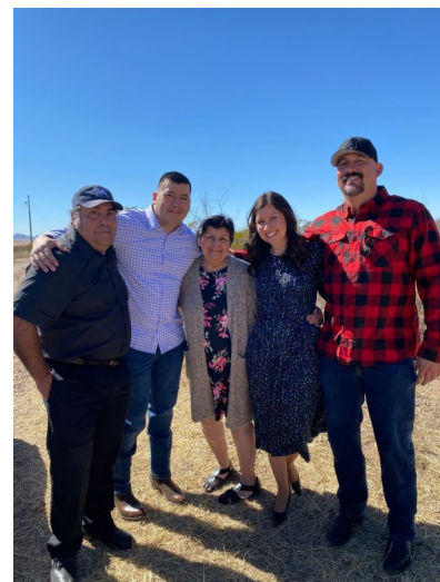
Greetings from the Parra Family!