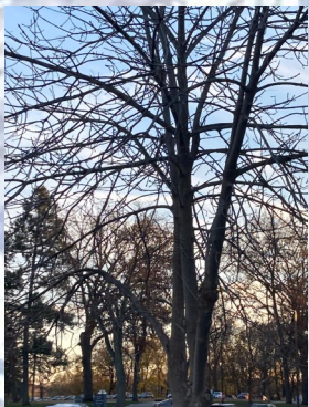
Not many leaves!