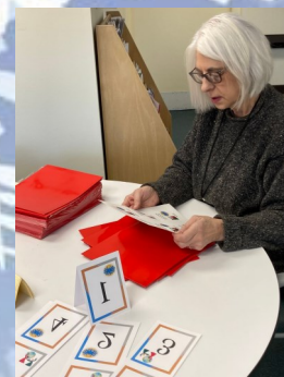
Preparations for our February gathering!