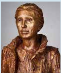
IBVM Founder, Mary Ward